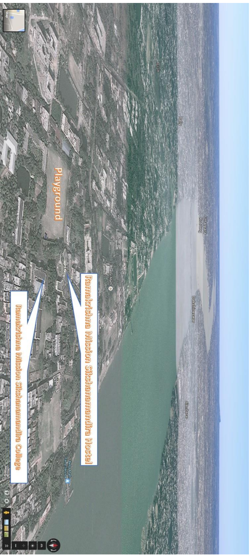
An Aerial View of Ramakrishna Mission Sikshanamandira, Belur Math, Howrah – 711 202